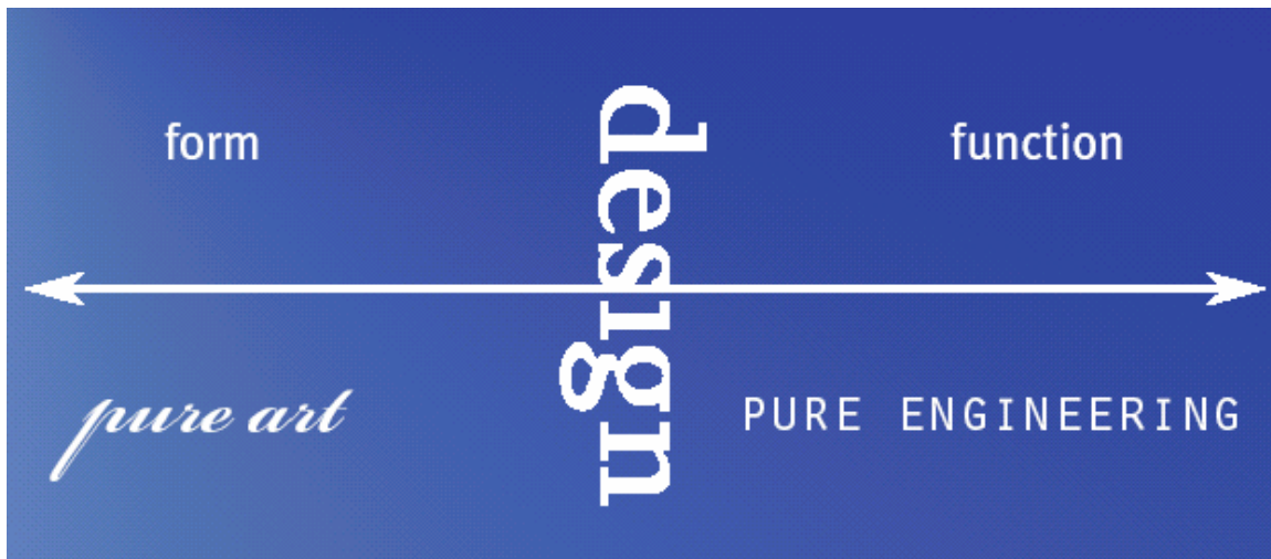
Figure 1. Design Combines Both Form and Function. Pure Art Lies at One Extreme While Pure Engineering Lies at the Other.

are becoming highly visual and dynamic. Most personal computers, for example, come with sound cards and other integrated visual / aural features. Taken together, these sensory features are commonly called "multimedia" by the IT profession. Unfortunately, "multimedia" became synonymous with downsized and grainy video, inferior sound, and slow response. Despite the continued development of the Personal Computer, the PC paradigm remains firmly rooted in the text-only, mute, and function-oriented paradigm of its origins.