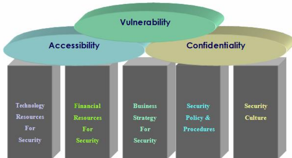
Figure 1: Eight Constructs Organized as the House of Security