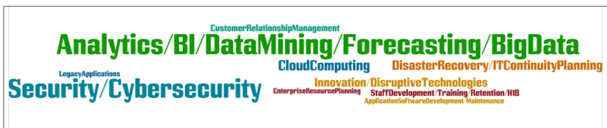
Figure 2: IT Investments that Should Receive More Investment

N = most senior IT leader in 769 unique organizations