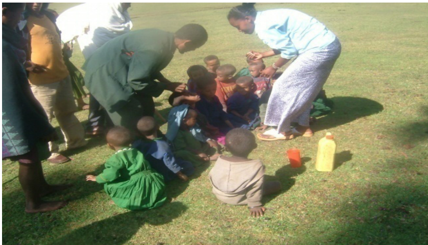
Figure 3: Provision of EOS service at Waita rural post. Photo taken November 2008.

“Children usually cry after having injection, so if I gave all the ingredients, including measles injection to one child, s/he might cry and all other children would be disturbed and everything will be in a mess. [...] at the same time, it will be easier for the recorder to tally each service correctly.” What she said was supported by the researcher’s observation that most children were crying after the injections.