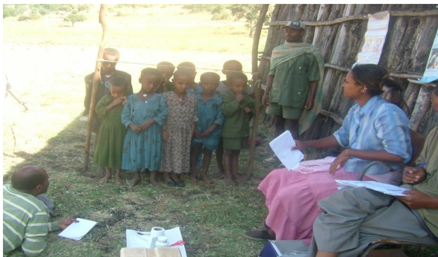
Figure 1: Measuring height of children using two sticks tied with rope at 110 cm. Photo taken in November 2008.