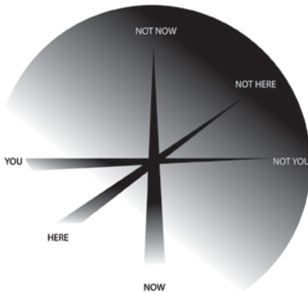
Figure 1. The 4 dimensions of time, place, relation and action define how the relation between witnessed presence and the negotiation of trust and truth can be understood. Next to the three axes, the dimension of Action is represented by the black and white parts of the sphere illustrating the possibility to act in the white of 'clear air' or the lack of possibilities to act in the black of 'no oxygen space'. (Graph: Max Bruinsma)

configurations have to be valued and judged from the perspective of the natural presence of human beings, and the environment they need, to be well and survive (Nevejan, 2007). In this respect it is interesting to notice that most current information and communication technology agenda's for innovation of truthful and trustworthy environments can be located in the black space of figure 1 in which there is no possibility to act for human beings to be involved. While most human beings love, have children, enjoy life and find trust and truth in the white 'action' space of the same figure 1.