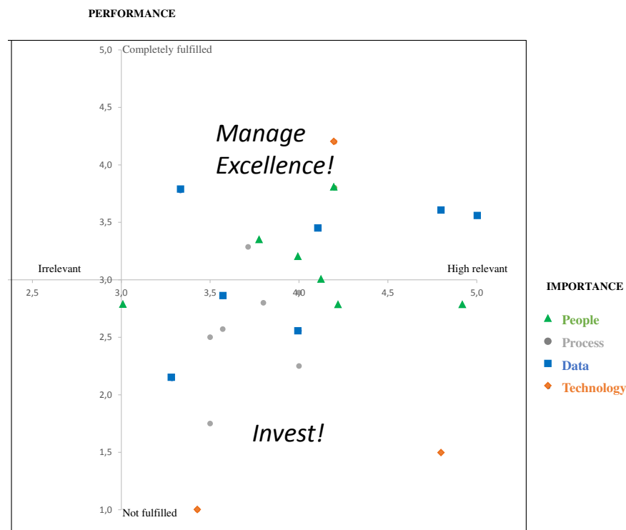
Figure 1. Fulfillment-Importance Matrix at the Case-Study Bank

as overarching questions, and discussing our results with the head of the strategy department. Our first result was that the bank did well in a few central topics of the company-wide adoption of BDA, since many fields of action were located in the “Manage Excellence!” quadrant. For example, the bank made an effort to establish a data quality awareness within regulatory-driven projects. Most interestingly, the fields of action located in the “Invest!” quadrant were distributed almost equally across the four BDA capabilities. Therefore, deriving a BDA roadmap as a purely IT-driven effort would have neglected a substantial share of the relevant gaps. The gap analysis revealed that the first step was laying the foundations for an IDO by, for example, establishing a team of specialists, introducing an explicit research environment, and adopting basic technologies. On this basis, the bank could then begin with the more culture-oriented shift toward an IDO by focusing on generating innovative ideas, agility, and speed when it comes to the implementation of ideas.