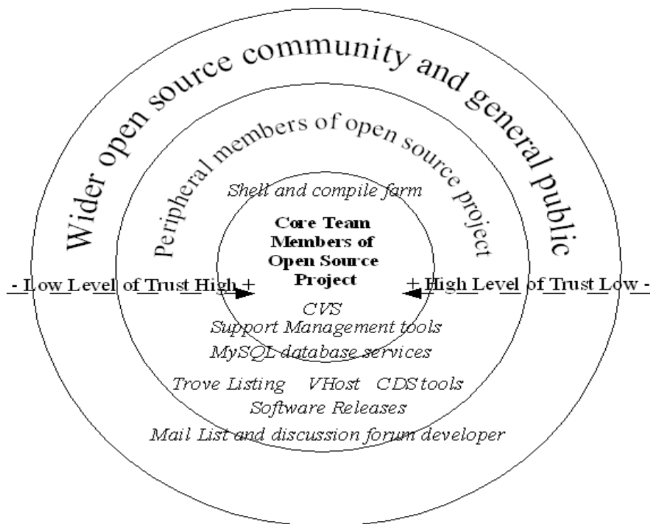
Figure 1 Sphere of Trust and Access to Open Source development tools in Open Source Projects: (developed for this research)