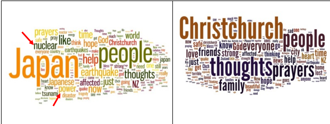
Figure 2. Word Cloud