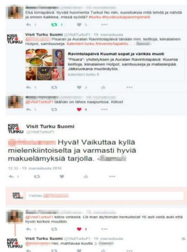
Figure 1: interaction with customers on Twitter (resource provided by Visit Turku)

[Travel advisor 1 and 2 from Visit Turku]