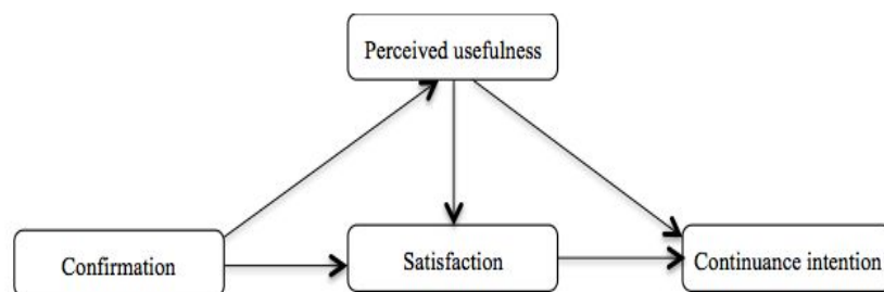
Figure 1. IS post-acceptance model based on ECT [16]

Bhattacharjee [16] introduced ECT to the IS field and proposed an IS post-acceptance model based on ECT. In the IS post-acceptance model, user satisfaction with their prior IS use and user perception on the IS usefulness affect user's continuance intention to use the IS. User satisfaction is determined by the perceived usefulness of the IS and the confirmation of expectations based on prior IS use. In addition, IS users' confirmation of expectations has a positive influence on the perceived usefulness of IS. Figure 1 illustrates the core constructs and relationships in the IS continuance model.