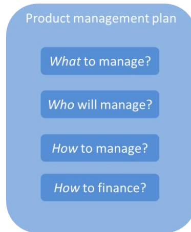
Fig. 3. Elements of the product-management plan

template to form a lifecycle plan for a software product that needs governance during its lifecycle. The following four tables then describe each element in detail. Each element contains issues that need to be considered and documented for any software under management. Therefore, when applying the CO-SLM model and CO-SLM framework it should be borne in mind that each software product – and its associated community – is unique. Thus the model and framework must be applied to suit the context. This means making adjustments to terminology and content when applicable.