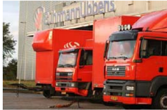
Figure 3: Some of Buhrmann's fleet of 50 trucks