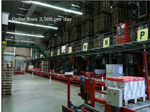
Figure 2: Buhrmann Ubbens warehouse, Netherlands