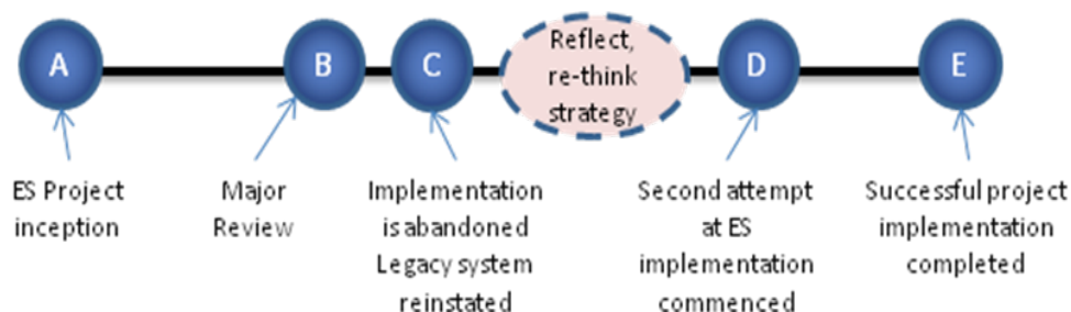
Figure 2: Timing of the Judgment Regarding Failure

Whilst helpful in the analysis of a case like this, we argue that these four failure categories discussed above do not cover perhaps the most critical aspect of this case. Executive management in Head Office ultimately supported the recommendation of the review team to terminate the implementation and reinstall the legacy system. The unusualness of such a proposal is shown by P1 who commented that “ I never imagined we might make such a recommendation ”. The gravity of such a decision should not be underestimated, and it was made in spite of the viewpoint expressed in three of the four narratives that the functionality problems could have been remedied, and indeed a costing to support this had been done. But this ‘failure’ was not the end of the project. The decision to terminate was a strategic one: the project had not ended at all in the mind of Corp eX management. They had taken the decision with the clear strategy of pulling back, reconsidering how they might better approach implementation once again, and then they intended to re-implement the so-called failed system once again. This has already occurred (see point D in Figure 2 below), and at the time of writing, Corp eX is about to go live with Company Y staff now well and truly integrated into the Corp eX fold and all parties confident of a successful outcome (see point E).