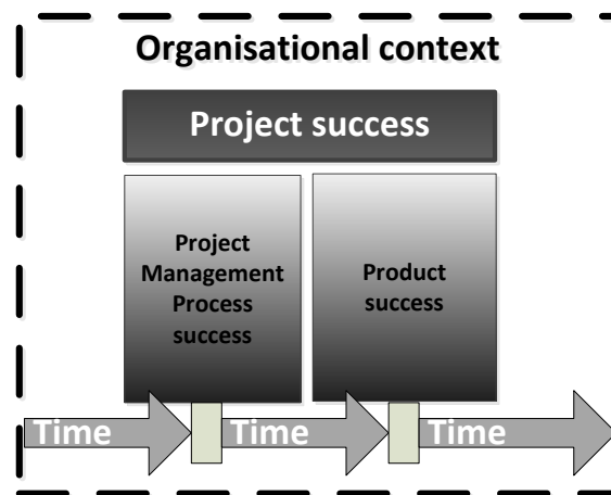
Figure 1: Project success framework used by the paper

Based on the literature findings this paper builds a framework of three dimensions of success factors. The framework includes the dimensions of project management process success, project product success and organisational context. The organisational context incorporates the time dimension and considers the time dependencies between project management process success and product success.