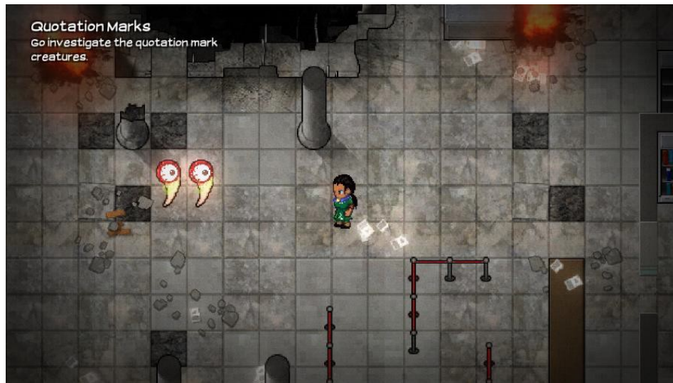
Figure 2. Player Confronting Monstrous Creature, Quotron

For revamping the game, a game storywriter joined the team and wrote an interesting script for the new game entitled Tesla's Revenge . The game was transformed from a mystery game into an adventure game in which the player is a student in a library. When a mysterious malefactor blasts a hole in the middle of the building, the player is sent on a journey to uncover the mystery regarding who would cause such destruction and what would serve as motivation for the destruction. Figure 1 shows the game level depicting the destroyed library. The identity of the perpetrator remains unknown to the player until the end of the game. At the end of the game it is revealed that the enemy is an undead Nikola Tesla who is consumed with enacting revenge on the world for forgetting about his scientific contributions. Tesla uses his death beam invention to etch the hole in the middle of the library. The death beam is so appropriately named for its ability to destroy any object it passes through. Beyond its ability to enact death thoroughly, the death beam also releases chaotic energy that infuses objects around the library and turns them into monstrous creatures.