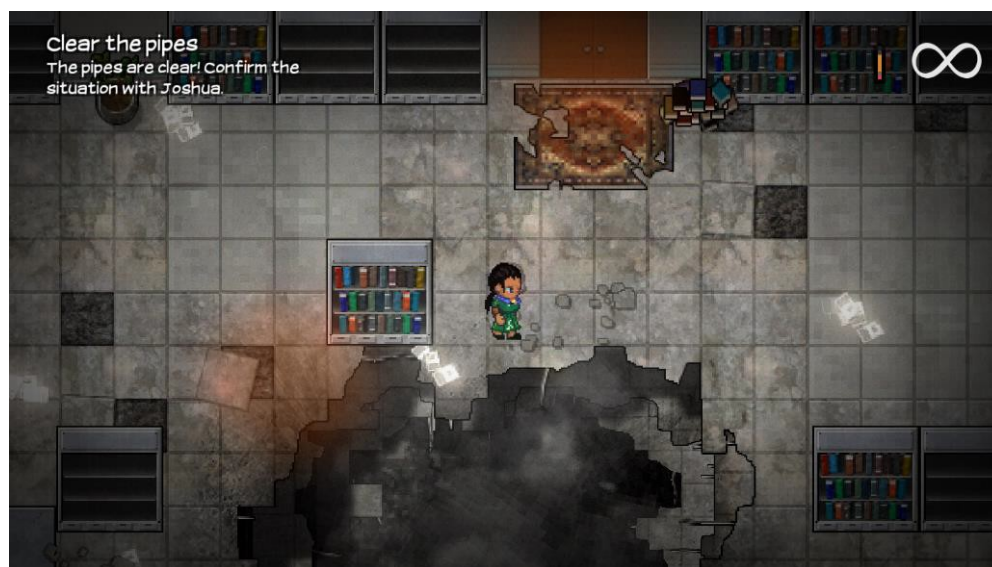
Figure 1. Basic Game Level

Designing and developing a game usually requires a long and iterative process, and the first version of a game can be radically different from the final version. Such is the case with Tesla’s Revenge . The development of Tesla’s Revenge started in the summer of 2014. The first iteration of this game was titled Chasing the Truth , a mystery narrative, and it was a lot different from the game presented in the paper. Far along into the development cycle, our team realized Chasing the Truth lacked a number of features of an entertaining educational game, the most important being the overall lack of fun. The previous version, Chasing the Truth , was not enjoyable to play in many ways as it was too linear and unengaging in the gameplay. It was more of an instructional software that uses little gaming features and focuses on transferring knowledge. Therefore, the development team decided to reconstruct the overall design of the game.