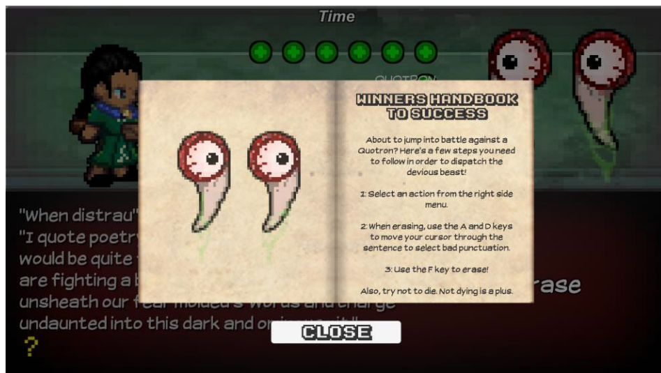
Figure 3. Mini-Game with Quotron for Correcting Punctuation Errors

Throughout the game, players are confronted with creatures that have been infected with the chaotic energy (as displayed Figure 2). Each encounter opens a mini game which is used to teach specific types of information literacy concepts (as shown in Figure 3). The first enemy the player will encounter in the game is Quotron , a giant pair of floating double quotation marks. The creature is ugly and intimidating, but if the player successfully removes the incorrect punctuation in the mini game, the Quotron will be cleansed and leave in peace. Other mini games (as shown in Figure 4 and Figure 5) include a keyword search game that is used to recalibrate the search engine within the library computers, and a word sorting game that unclogs the water pipes so the fires around the building will be put out. These mini games have three purposes: to engage and entertain the player,