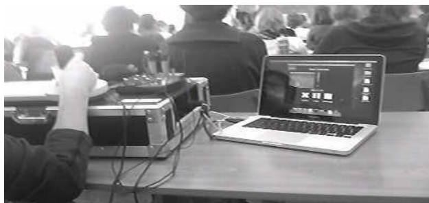
Figure 2: Video Recording Session

server. The recording box software on the podcast system captures the videos from the server on the link http://recordingserver.science.ru.nl/