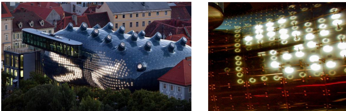
Figure 1. The Kunsthaus Graz (left) and the game of Go being played on the facade (right)(CS, 2017, PBS, 2017)