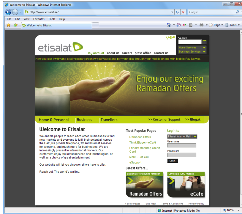
Figure 1. The home page of Etisalat.