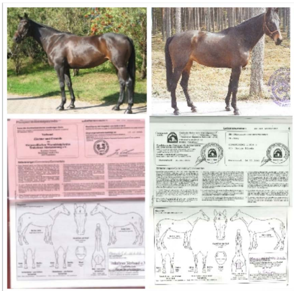
Figure 1: Can you identify which horse has which passport?