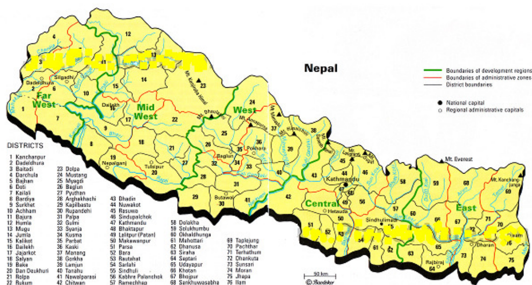
Figure 1. Map of Nepal

development report 2004 shows that the mountain region has the lowest human development index (HDI) score amongst the three regions and is also the poorest (UNDP, 2004). The social, political, and economic disparities among regions flared up conflicts among different communities and political institutions. Consequently, it eroded the social capital that existed within communities (the binding elements of trust), and severely disrupted indigenous forms of social networks and institutions (the bridging of the elements). Clearly, the mountain region is the most underdeveloped. It was here that the project we studied, NWNP was initiated. It is situated in the Myagdi district of Nepal which is located at an altitude of 2700 meters above sea level as depicted in Figure 2.